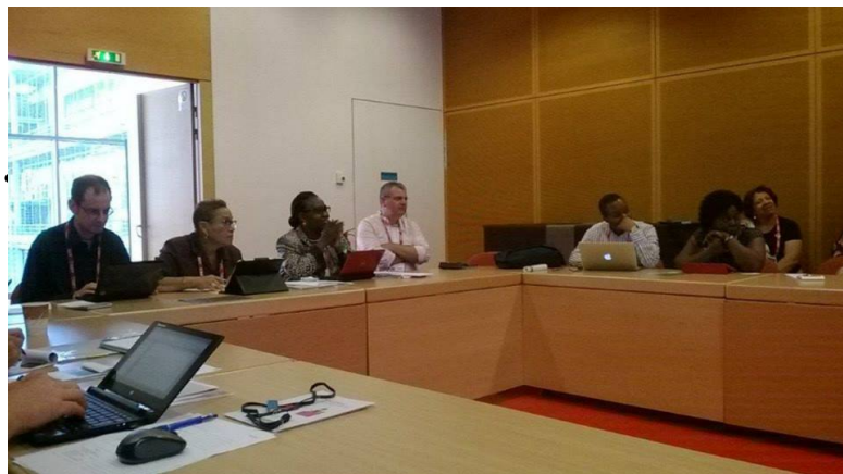
19 August 2014.