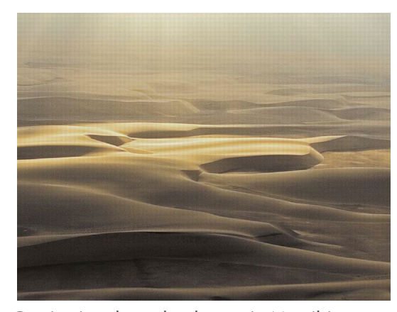
Captivating desert landscape in Namibia.