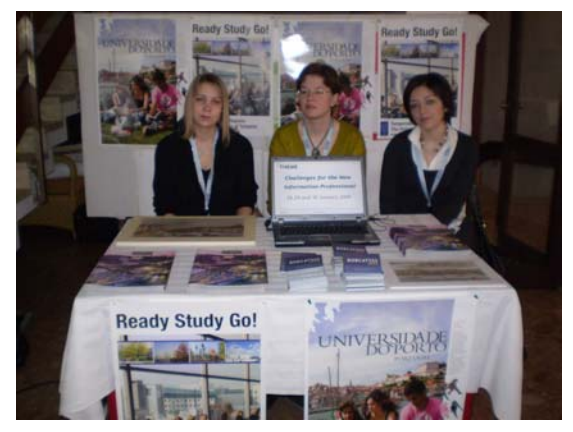
Inivitation to join BOBCATSSS 2009 in Porto, Portugal!

For me and my students this year's symposium in Zadar had a special meaning. We were collecting experiences of and learning about organizing a conference since our students are co-organizers of Bobcatsss 2009 in Porto, Portugal. Our students have actively participated previous symposia but now our viewpoint was different.