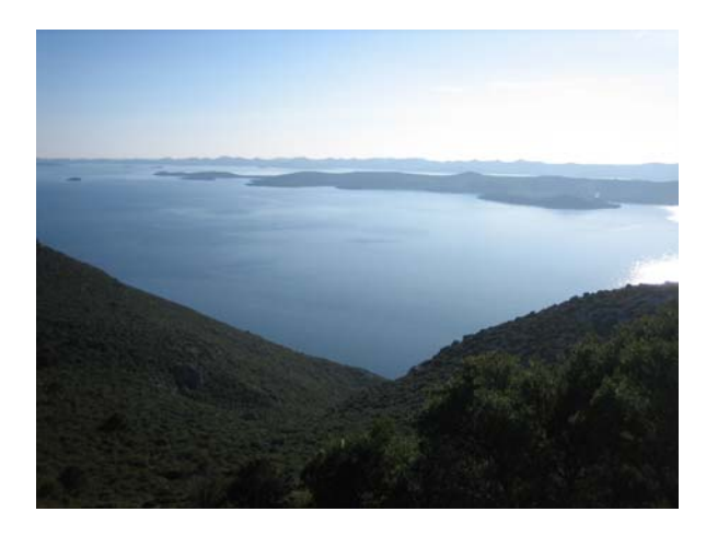
The Archipelago of Zadar

On the second day of the symposium we decided to go by ferry to the nearby island (the island of Ugljan) where we climbed up the mountain to see the fortress. We discovered the beauty of the unique archipelago of Zadar. The view up there was amazing and breathtaking. We were exhausted and joyful at the same tame.