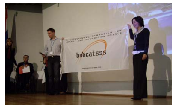
Overhanding the BOBCATSSS flag to the BOBCATSSS 2009 organizers

The enthusiastic closing Ceremony meant to us the great responsibility we have now but also gave us the so necessary support, which we transmitted to all the students and teachers that stayed at Finland and Portugal.