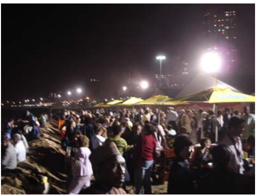
Beachparty in front of the Durban skyline.

industrial sector rooftops. The proximity of the tables made for easy flowing conversation with other IFLA attendees, including the familiar faces of people met at library school 8,000 miles away, and the unexpected reunions with colleagues met on projects or other LIS events. Our main point of interest were the sessions dealing primarily with information literacy (IL) in all its guises scattered throughout the IFLA programme. Of primary importance was the meeting on Monday afternoon discussing the collaboration between IFLA and UNESCO on global IL initiatives, such as the Information Resources Directory Literacv (http://www.infolitglobal.info/index.php) where one can also find the State of the Art Report on IL provision by individual countries and details of the context for an international information literacy logo.