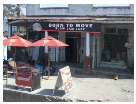
Individual entrepreneurship in Durban Township.

I look out the bus window and concur. I see many street signs which reflect African heritage and pride. I also see signs of individual entrepreneurship since the rules changed, "Buddy's Bottle Store, Buck's Bargain Center, and Boston Media. "There is a great deal of hustle and bustle in the largest city in KwaZulu-Natal province (one of 9 in South Africa). There are 170 public libraries in the province – we are visiting three.