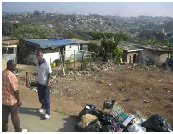
Durban Township.