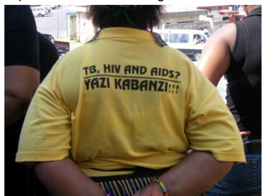
Protecting HIV in Durban Township.

I look out the bus window and concur. I see many street signs which reflect African heritage and pride. I also see signs of individual entrepreneurship since the rules changed, "Buddy's Bottle Store, Buck's Bargain Center, and Boston Media. "There is a great deal of hustle and bustle in the largest city in KwaZulu-Natal province (one of 9 in South Africa). There are 170 public libraries in the province – we are visiting three.