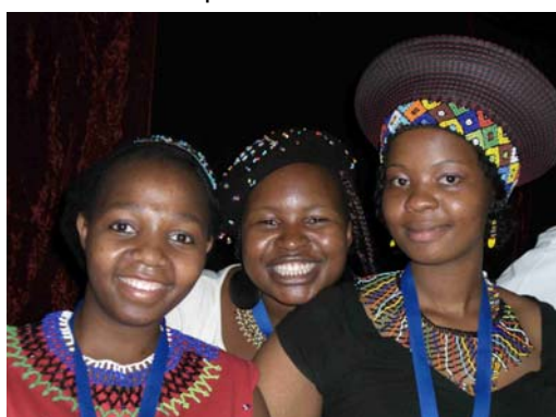
Young South African Volunteers at the Mayor's Reception.