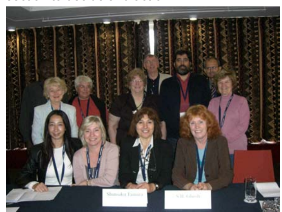
New elected Members of the SET Standing Committee

In October 2006 CPDWL suggested that the Mission Statement should place education and training concerns in the context degree-granting institutions so differences between CPDWL and SET would clearly be defined. The suggestion came probably because of a slight misunderstanding in relation to the program in Seoul. In Seoul, SET ran a session on continuing education of LIS teachers. Overall, our discussion ended with the conclusion that we do not need to change our mission statement. It was also suggested that the two sections could take a meeting to clear possible misunderstandings. This would be up to the new officers of the section to decide and act on.