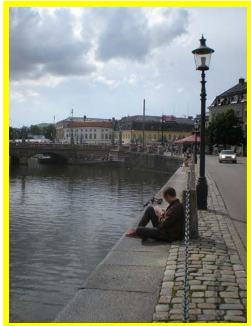
Where we wish we were while in Gothenburg.