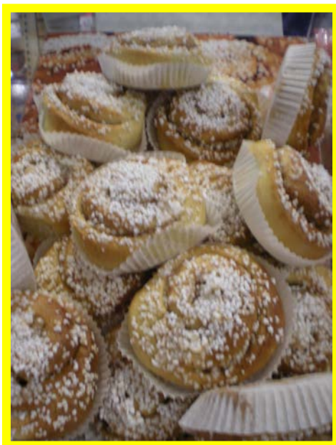
Why we'll come back to Sweden.