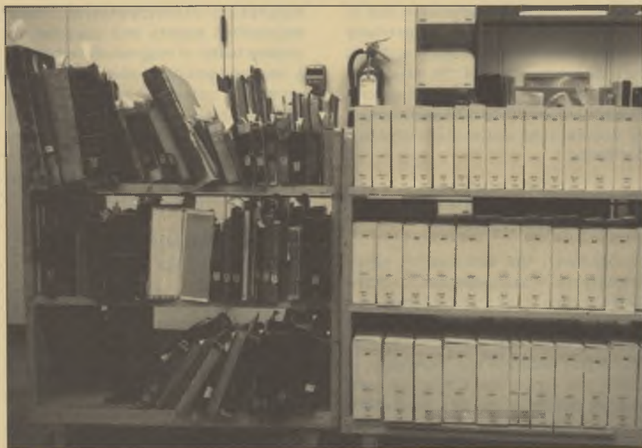
Right: phased conservation boxes.

the original dimensions existing before the fire. It was discovered by this test that an average of 4 mm compression was achieved by using a one kilogram weight. If a boxing technology could be designed that would produce custom fitting boxes and not increase the added thickness by more than 4 mm, no extra shelf space would be required. There was no such technology that could meet such demands.