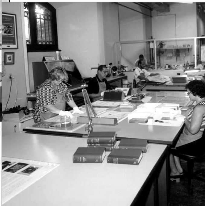
Conservation and Binding Center

16th century. Two volumes with 112 engravings in color and black and white, will be displayed in an exhibition and included in a CD-ROM sponsored by a private company.