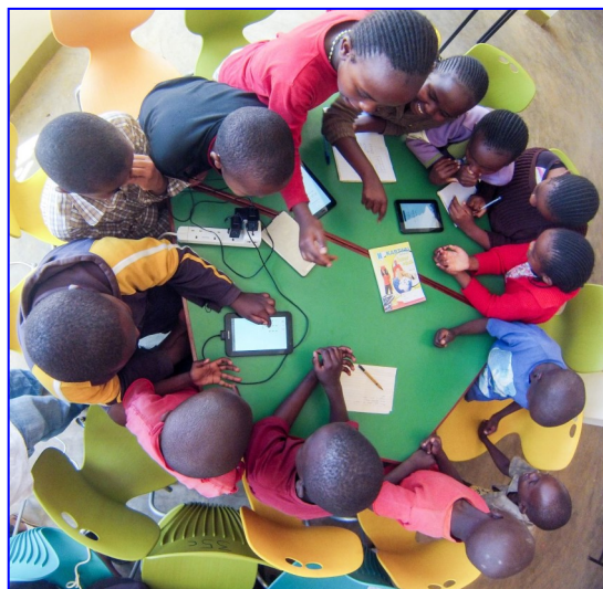
Children participating in educational activity in the library in Kibera (Kenya)

Does your library have a story to tell? Share it on IFLA's Library Map of the World SDG stories.