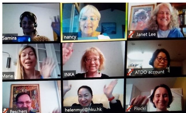
Our LSN Team hold our Board Meeting