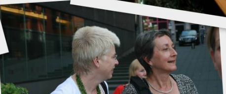
SC members in action