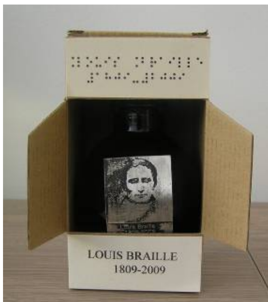
The smallest champagne bottle in the world with Braille text

June: An exhibition named “Books, Champagne and Wine with Stories” was held for the whole month at the library. The oldest Braille books and music were exhibited together with bottles of champagne holding tin plates with Braille letters and Louis Braille figure.