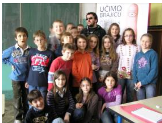
Workshop for elementary school children

January: A competition in Braille reading was organized in local branch organizations of the blind.