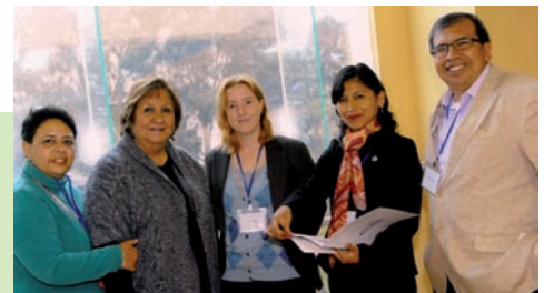
Peru project team met in June

The Colegio will become the focal point for all other library associations in Peru, coordinate activities, and lead the profession in Peru. They will collaborate with other library associations to increase activities and services for all library workers, and work to increase the standards and status of professional librarians.