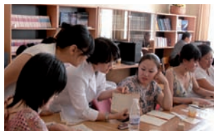
IFLA PAC Korea center held a Conservation Workshop at the National Library of Mongolia

In 2010 the maintenance work carried out by the Permanent UNIMARC Committee concentrated on the preparation of future updates towards the implementation of the ISBD Area 0 and further alignment of the formats with the concepts and terminology of FRBR. The implications of RDA for UNIMARC were also a current topic of attention, as well as the preparation of the UNIMARC Guidelines for Manuscripts. The UNIMARC/Holdings format was not subject to any change. The UNIMARC/Classification format is still in progress. Future work on a UNIMARC mapping to the RDA and ISBD namespaces is being considered, which could in turn inform the work of the W3C Library Linked Data Incubator Group.