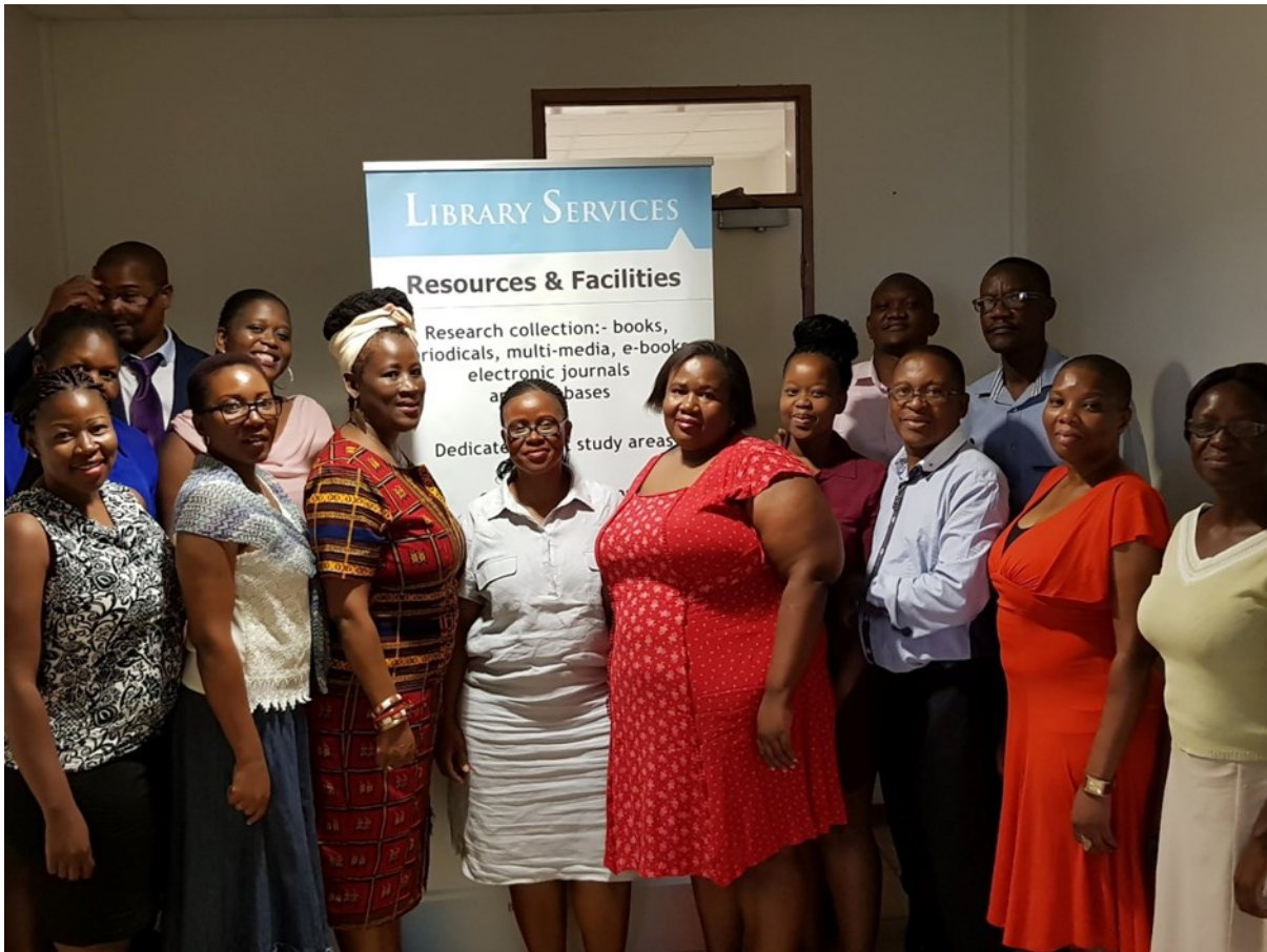
Librarians during the first meeting that was held in Botswana International University of Science and Technology.

The main purpose of the Forum is to bring together library professionals in and around Palapye with a view to sharing experiences and leveraging on each other's skills, competencies and strengths for service improvement in libraries. In view of this purpose the Forum is currently implementing an initiative called "Nketela", which entails visiting local libraries for assessment and possible support.