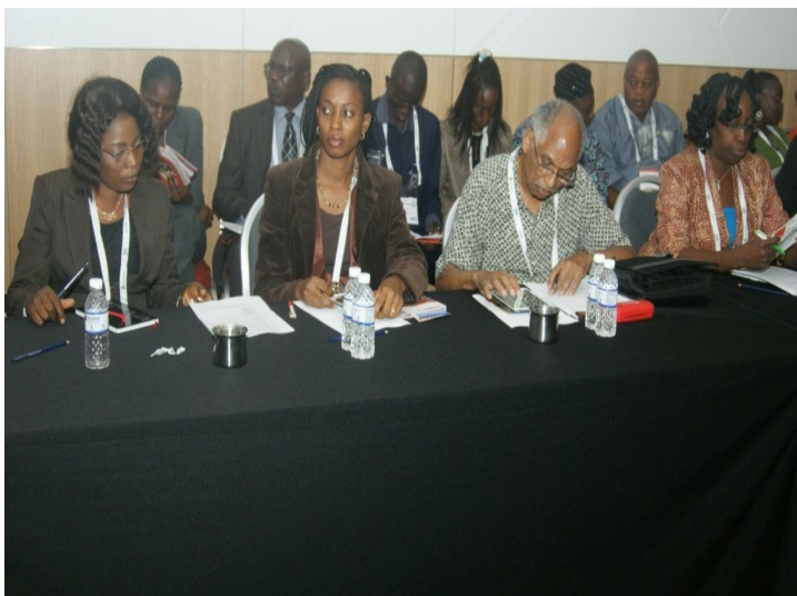
Participants at the forum

Over 150 participants attended the Africa Section Open Forum with the theme “Future African Libraries: Innovation and Creativity” held during the Singapore conference. The Forum featured two paper presentations: Dr.