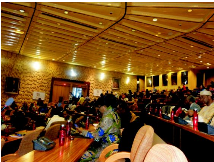
Cross section of participants at the summit

AfLIA was heralded in a beautiful, culturally appropriate "Harambee"; a Kenya ceremony to welcome new born babies where everybody with good wishes for the baby is encouraged to drop a token gift. African librarians at the Summit did this with style and panache.