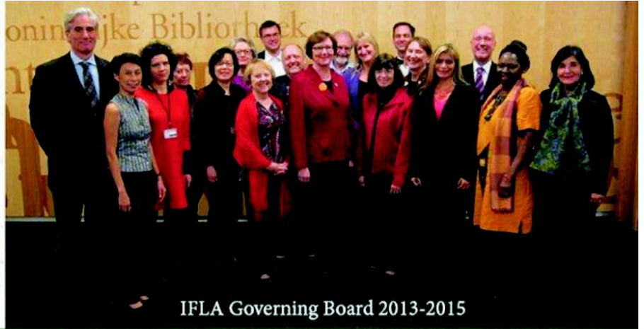
IFLA Governing Board 2013-2015

IFLA thanks you for your support in 2013 and wishes you a successful 2014