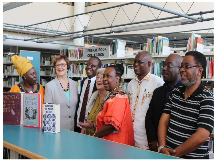
Visit to a library in Namibia