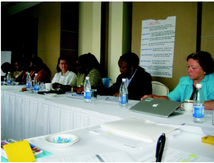
Brainstorming to develop the Draft