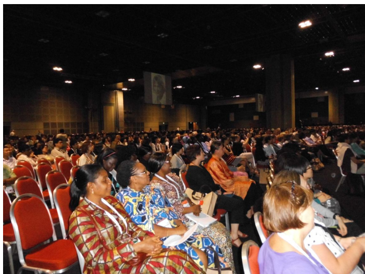
IFLA session in progress

and Information Associations and Institutions (AfLIA); International Conference on African Digital Libraries and Archives (ICADLA); eIFL-PLIP projects and Arid Land Information Network. Over 300 participants visited the Stand in the course of the two days.