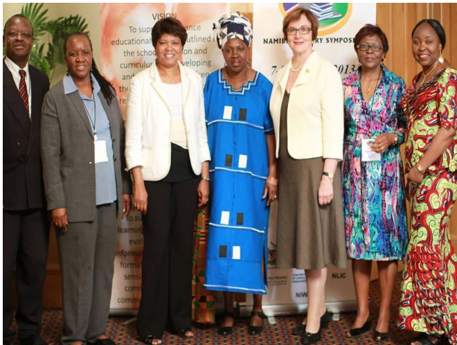
3rd from right: IFLA President with SC members at the event

The Namibian Library Symposium held from 7 – 9 October, at the Safari Hotel and Conference Centre in Windhoek, Namibia. The Symposium was organized by the Namibia Library and Information Council in collaboration with the Ministry of Education; the Namibia Library and Archives Services (NLAS); libraries of the University of Namibia; Polytechnic of Namibia and the Namibia Institute of Public Administration and Management. The Symposium focused on the IFLA President's theme (2013-2015): "Strong Libraries, Strong Societies". LIS leaders in Africa were on hand to welcome the IFLA President to the continent and to engage with colleagues and policy-makers from across Africa and overseas to discuss how libraries can power development.