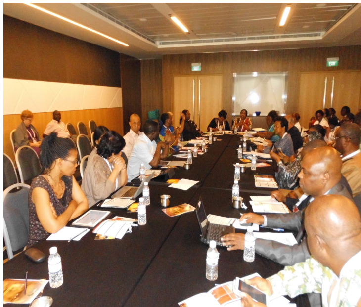
Standing committee meeting progress

Having received all relevant reports, the Standing Committee discussed the IFLA Strategic Plan for 2013-2015. Key achievements by the Section also discussed were the successful hosting of the Africa Library Summit in Pretoria in July, 2013 and the Mid-Term meeting of the Section held in Abuja, Nigeria in February, 2013. Members at the meeting were encouraged to attend the IFLA WLIC 2015 which will take place in Cape Town, South Africa.