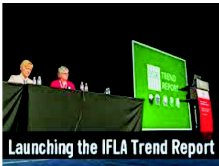
Presentation of IFLA Trend Report

The IFLA Trend Report and IFLA Library were presented at the conference. The Trend Report identifies five high level trends shaping the information society as; new technologies; access to education; privacy; civic engagement and transformation. The Report urges libraries and librarians to re-position their services in order to maximise the impact of these trends.