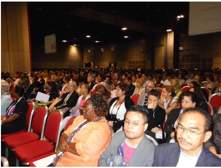
Cross section of participants at the congress

The IFLA Library is a selection of resources to help librarians understand where libraries fit into a changing society.