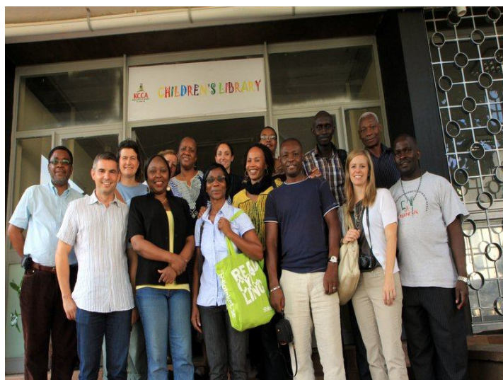
The Advisors at a children library in Uganda

It would also include digitization of local history/oral tradition and culture; and other national treasures that are in print form only. Another expected outcome is establishing community/youth digital information centres; and establishing a research fund for libraries, among others.