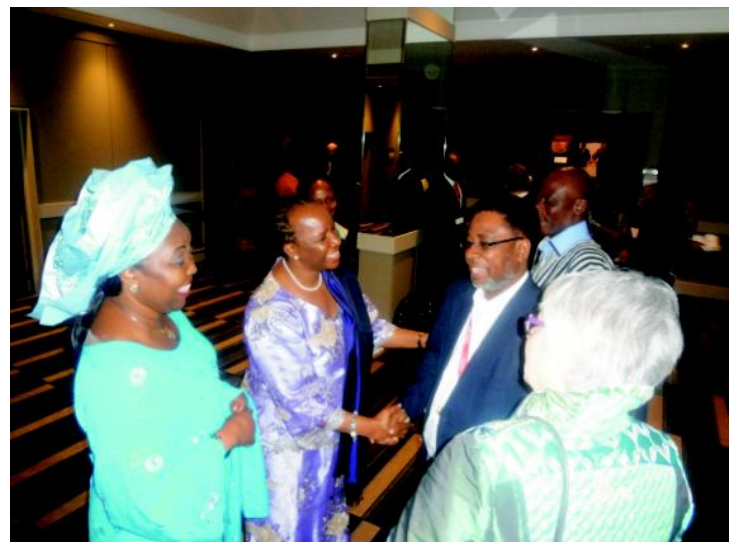
IFLA President shares ideas with SC Members

Three Networks were launched during the African Library Summit held at the University of South Africa, Muckleneuk, Pretoria from 2-5 July, 2013.