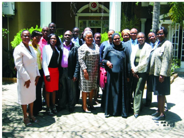
Participants in a group photo after the meeting

On 11 December, 2013, the Botswana Library Association (BLA) met with the stakeholders of the library and information science sector in the Country. The meeting which took place in Gaborone, Botswana had the representatives of the Reader's Association; Writer's Associations; Office of Botswana Vision 2016; Publishers Association; University of Botswana Department of Library and Information Services; University of Botswana Library Services and The Botswana Library Consortium in attendance. Stakeholders were invited at the meeting to be given an update of the BLA performance in recent times. The meeting also provided the Association the opportunity to receive input from stakeholders on how to improve the BLA services and on the preparation for the BLA annual review meeting which also held in December 2013.