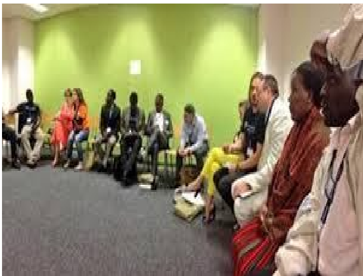
Cross section of participants