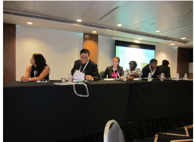
ILP Associates meeting at IFLA WLIC

For more details on ILP visit http://www.ifla.org