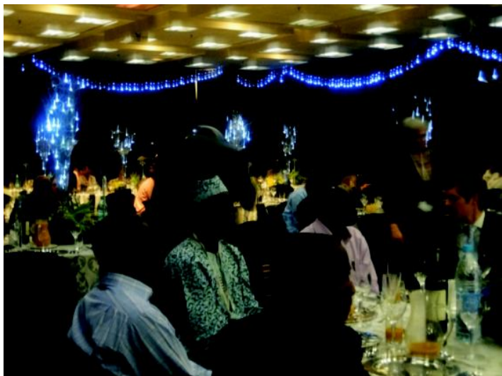
An evening after the day's meeting

The idea for AfLIA was muted during the Africa Library Summit in 2011 and the Interim Executive Committee was elected during the IFLA Africa Section Standing Committee Mid-Term meeting held in Abuja, Nigeria in February, 2013. AfLIA Secretariat headquarters is in Accra, Ghana.