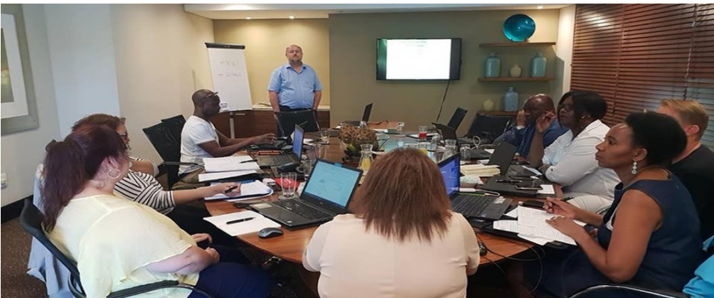
LIASA EXCO Handover 2016-2018 to 2018-2020 at City Lodge, Pretoria