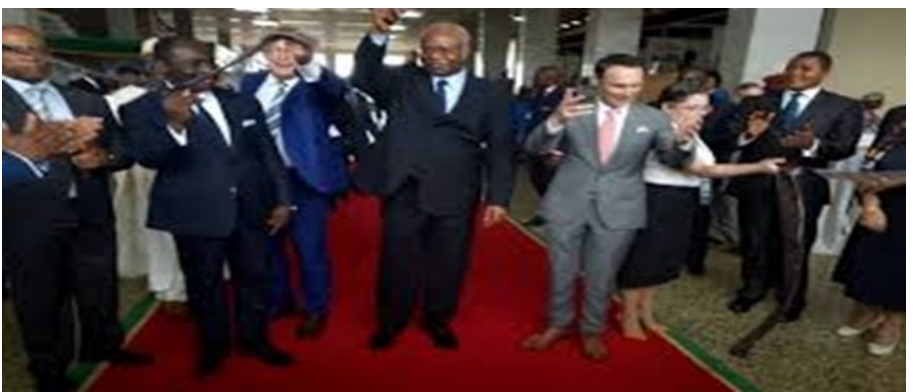
1. Conference Centre Yaounde, Cameroon