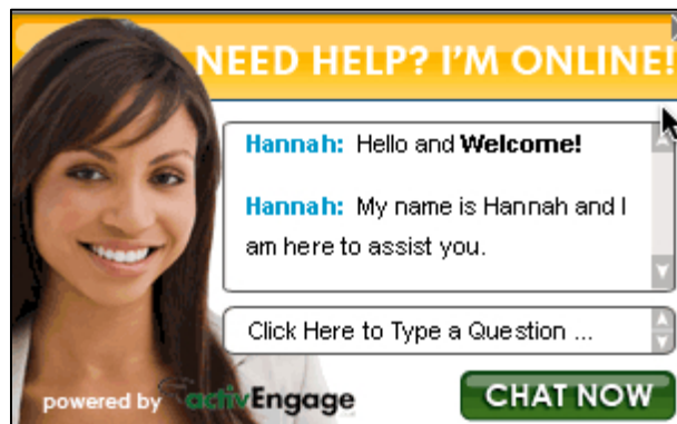
Longo Toyota web site ( http://www.longotoyota.com/index.htm )

The decision trees, based on specific topics, are examples of static improvements to a library's web site. A dynamic mediation that we would like to implement is already used in the e-commerce world. Instead of the static embedding of a reference chat widget, we hope to create programs that would recognize when a user needs assistance, and have the widget appear only at those times. The data used to determine when and where the widget appears would be based on time and content. Based on our chat transcript analysis we know where our patrons have the most trouble finding information or using our services. We also know, through web site analytics, which library pages are accessed most frequently. We could, using the example of our Interlibrary Loan information pages, determine that if an ILL page is open in the patron's browser for a determined time period, say longer than 2 minutes, a pop-up box would appear offering to connect the patron to a librarian, a service now provided by many commercial sites, such as Longo Toyota: