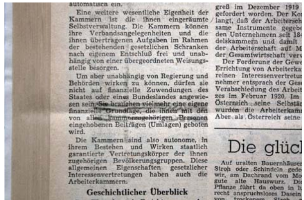
Fig. 6: Text background, folded pages