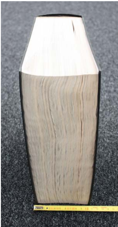
Fig. 1: Book thickness