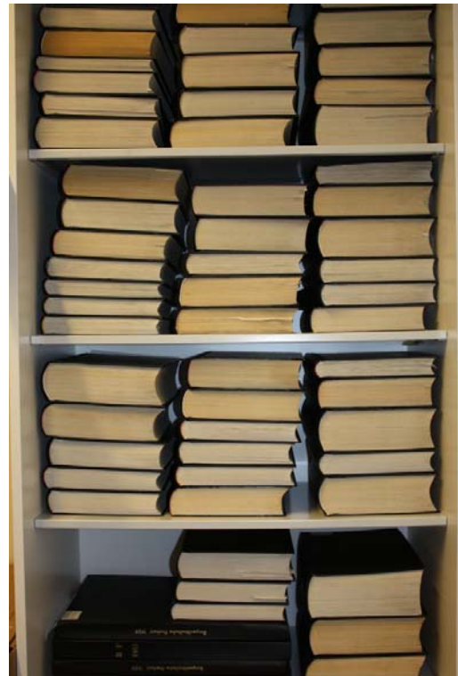
Fig. 8: Shelf with small books and in the lower part the big size books