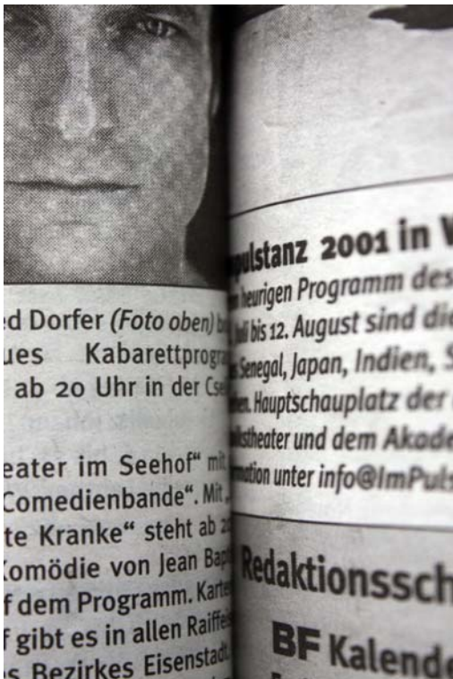
Fig. 3: No inner margin in the spine