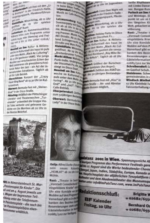
Fig. 4: Moiré effect