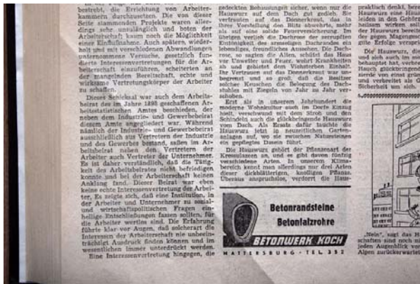
Fig. 5: Creased, buckled page