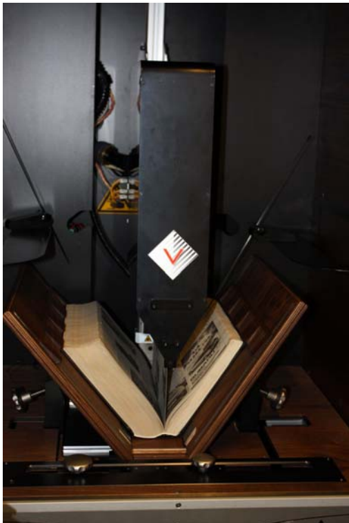
Fig. 7: Automatic bookscanner ScanRobot® SR301