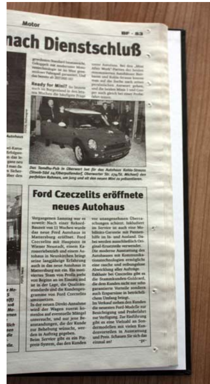
Fig. 2: Wavy pages